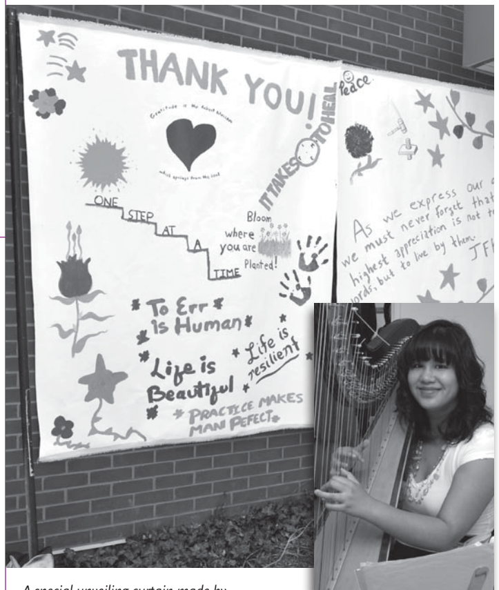
A special unveiling curtain made by CAMH clients to thank the McCain family for their support.