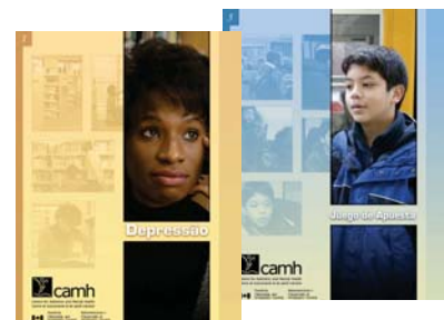
Illustrated photo-novellas have been translated to provide mental health education and resources to Spanish- and Portuguese-speaking people.

CAMH's Provincial Services Health Promotion Unit is actively involved in a wide variety of initiatives, including a provincial drug strategy (as part of the Health Education and Enforcement in Partnership [HEP] network), the Toronto Drug Strategy, and the National Framework for Action to Reduce the Harms Associated with Alcohol and Other Drugs and Substances in Canada.